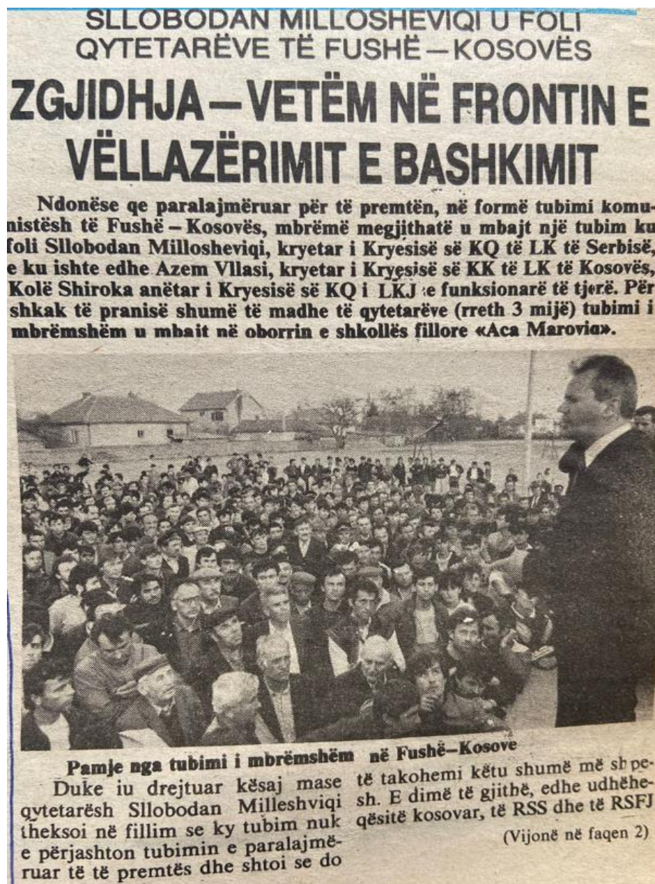
Figure 3 Milosevic Speech - Fushë Kosova 1987

The Fushë Kosova rally is emblematic in terms of mechanisms through which political leaders exploit historical grievances and manipulate collective memory to foster support for nationalist causes. By proclaiming: "No one should dare to beat you", Milosevic not only positioned himself as the defender of the Serbian people but also legitimized the use of force in the name of national security. This rhetoric is precisely designed to evoke a siege mentality, portraying Serbs as victims of historical injustices and present-