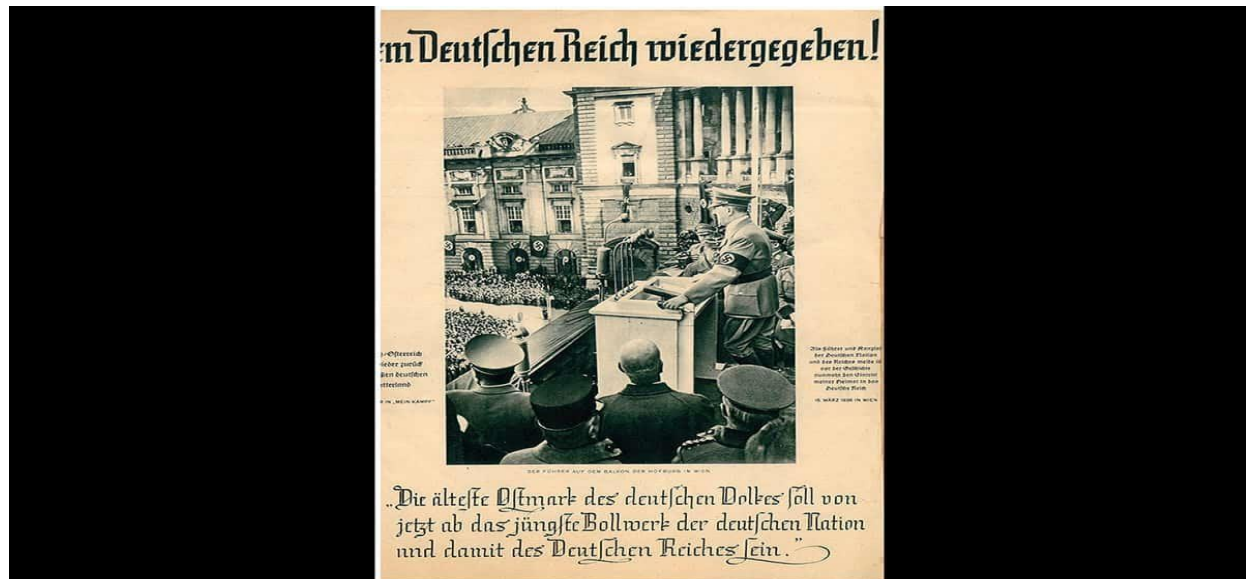
Figure 7 Local newspaper reporting the annexation of the Sudetenland

The Nazi propaganda machine began by frequenting and distorting incidents of cultural and linguistic discrimination against the Sudeten Germans. The portrayal of Sudetenland Germans as