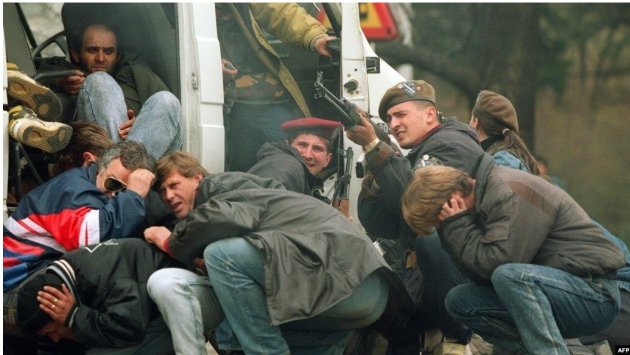
Figure 1 War in Bosnia and Herzegovina April 6, 1992