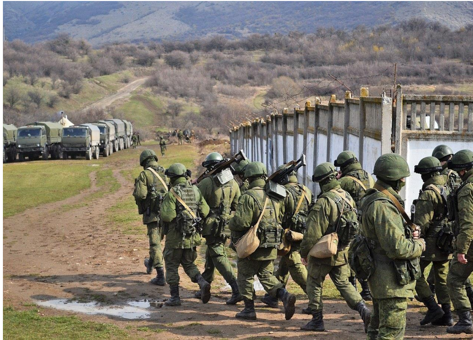
Figure 8 Russian soldiers (little green men), without identification marks carry out the orders of President Putin for the annexation of Crimea 2014

contemporary geopolitical conflicts, such as the situation in the Balkans, more specifically Serbia's strategy of using Serbian minorities in neighboring countries for its regional influence. The tactics of fabricating minority threats, exploiting international responses, and exploiting historical grievances bear striking similarities, underscoring the importance of critically evaluating such narratives and the motives behind them.