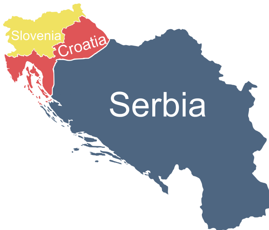
Figure 2 The map of Greater Serbia proposed by the chairman of the Serbian Radical Party Vojislav Sesel