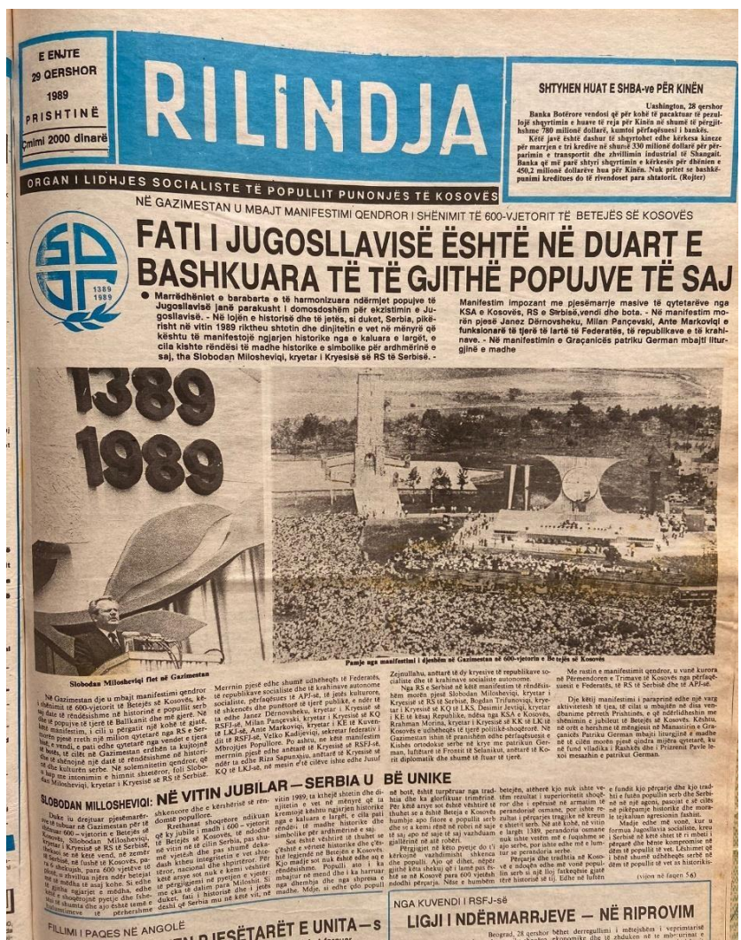
Figure 4 Milošević Speech - Gazimestan 1989

This strategy is not limited to the historical context of the late 80s, but continues as a powerful tool in contemporary Serbian politics. Trumpeting the narrative of threatened Serbs serves multiple functions: it consolidates domestic support by rallying the population around a common cause, diverts attention from domestic issues, and seeks international sympathy by portraying Serbs as perpetual victims (Bechev, 2024). Such tactics are not simply historical reflections but are actively used in current political discourse, indicating a deliberate pattern of behaviour intended to justify aggressive postures and, potentially, future military interventions under the pretext of protecting “national interest”.