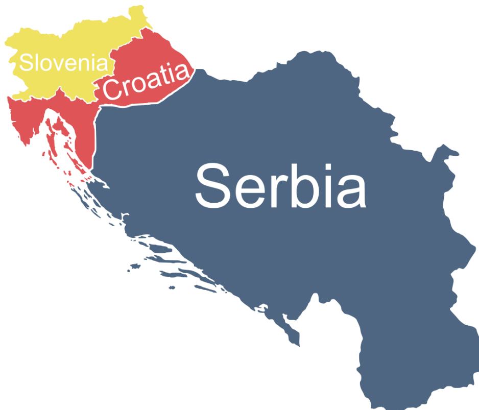
Figure 2 The map of Greater Serbia proposed by the chairman of the Serbian Radical Party Vojislav Sesel

The fabricated narrative of "a jeopardized Serbian minority" under siege by nascent sovereign states was the cornerstone of Serbia's justification for military intervention in Croatia and Bosnia. This intervention was framed as a protective measure, necessary to secure Serbs from the delusion of "genocide and persecution" – a portrayal that sought to echo in the collective memory of Serbia's past in the Second World War (Cox, 2002). By framing the military campaigns as efforts to defend their nation and people, Serbian leaders sought to galvanize domestic and diaspora support for their cause.