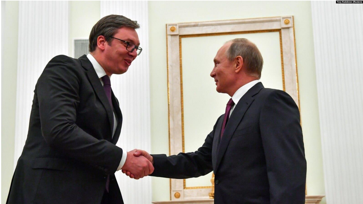
Figure 6 Vučić meets Putin at the Kremlin, Moscow

Serbia's hegemonic aspirations in the Balkans, fueled by a combination of historical narratives, nationalist ideology, and leadership ambitions, pose significant risks. The quest for dominance, reminiscent of past conflicts, threatens to destabilize the region, provoking tensions and potentially catastrophic conflicts. Serbia's actions, driven by the aim for territorial and political hegemony, challenge the principles of sovereignty and territorial integrity, echoing the dangerous precedents created in the 90s. The potential for unprecedented violence and destabilization is a strong reminder of the destructive power of uncontrolled nationalism and hegemonic ambitions.