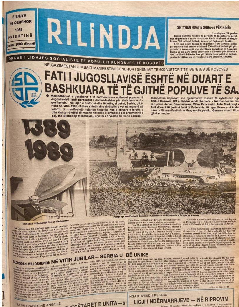
Figure 4 Milosevic Speech - Gazimestan 1989

This strategy is not limited to the historical context of the late 80s, but continues as a powerful tool in contemporary Serbian politics. Trumpeting the narrative of threatened Serbs serves multiple functions: it consolidates domestic support by rallying the population around a common cause, diverts attention from domestic issues, and seeks international sympathy by portraying Serbs as perpetual victims (Bechev, 2024). Such tactics are not simply historical reflections but are actively used in current political discourse, indicating a deliberate pattern of behaviour intended to justify aggressive postures and, potentially, future military interventions under the pretext of protecting “national interest”.