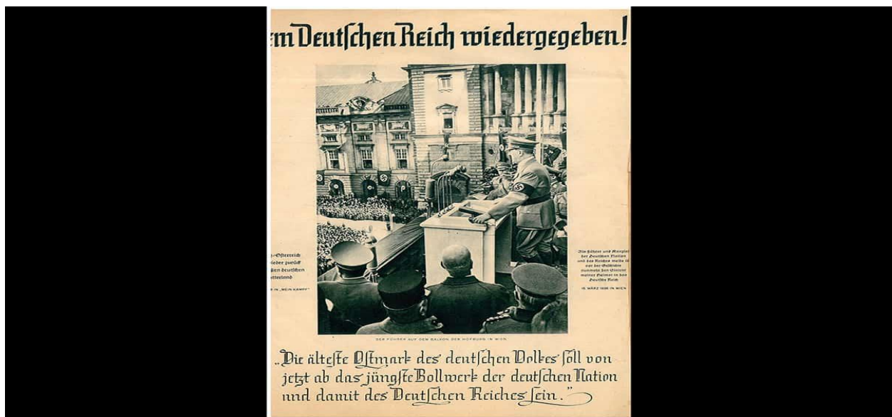
Figure 7 Local newspaper reporting the annexation of the Sudetenland

The Nazi propaganda machine began by frequenting and distorting incidents of cultural and linguistic discrimination against the Sudeten Germans. The portrayal of Sudetenland Germans as