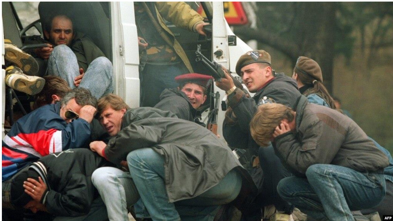
Figure 1 War in Bosnia and Herzegovina April 6, 1992